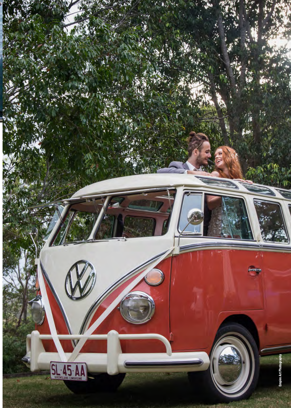
Empire Art Photography