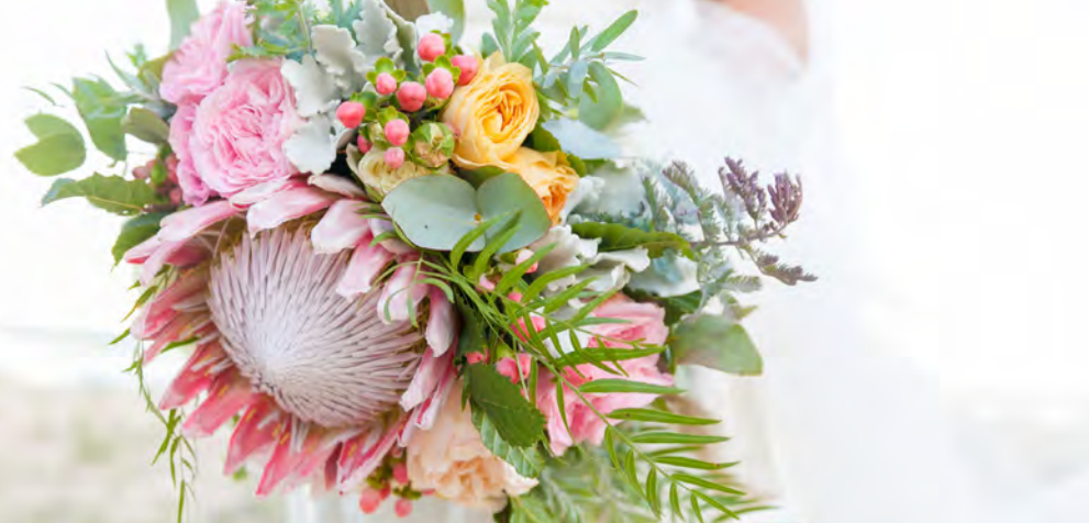
Karen Buckle Photography