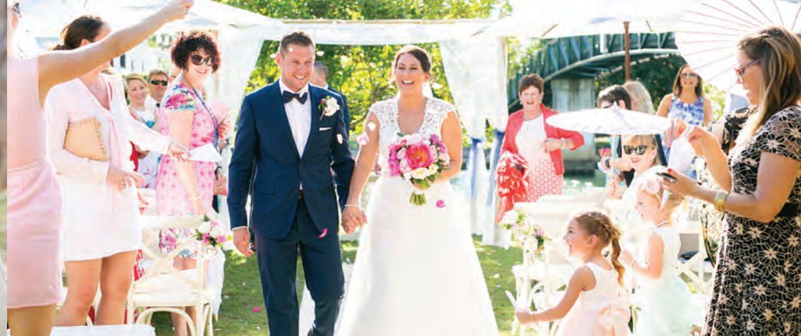
Life and Love Photography