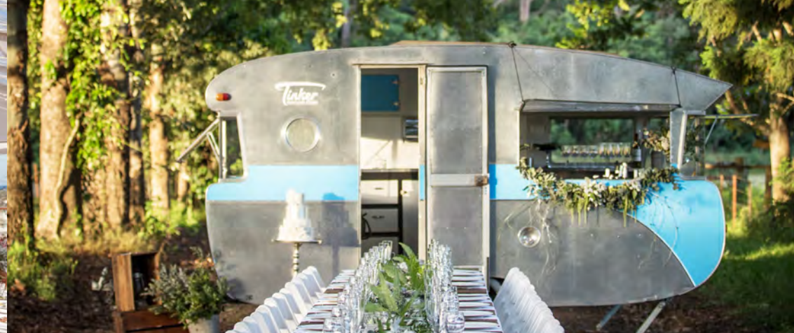
Empire Art Photography