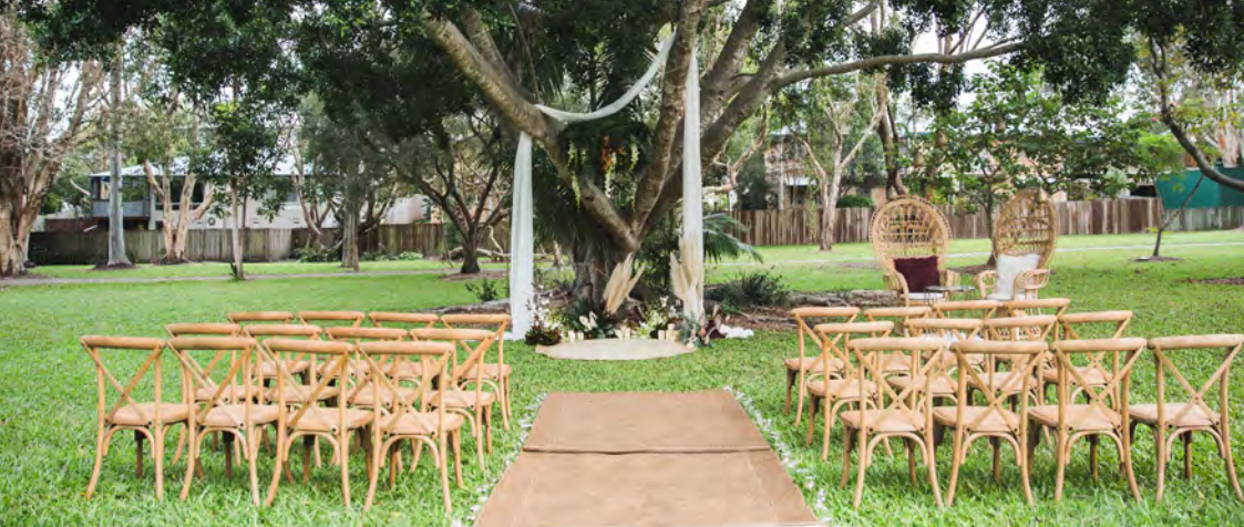
Immortalising Moments Photography