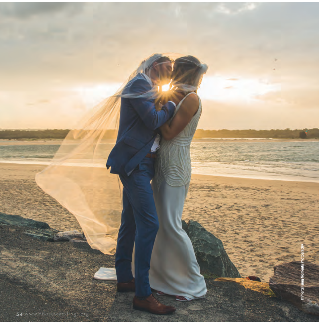
Immerse Moments Photography

The “Golden Hour” which is the best lighting to capture bride and groom main photos is the hour before and up to sunset. If sunset is at 6pm for example, it is best to be getting your main photos done from 5pm to 6pm.